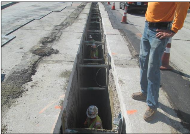
Placing sand bedding for recycled water at Main St.