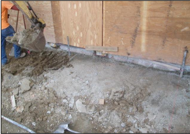
Demolition/grading at City Hall entrance.