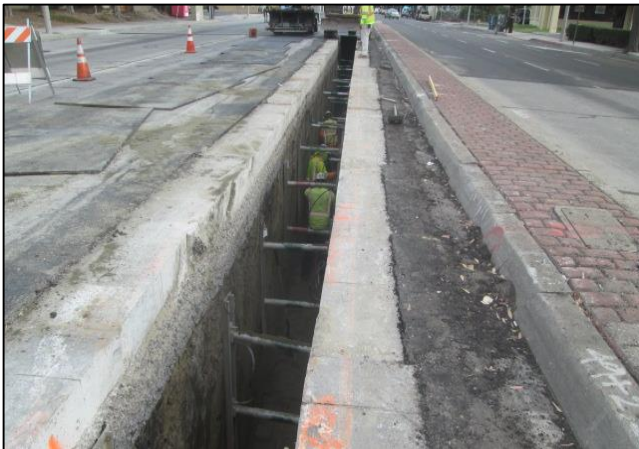
Recycled water trench north on Main.