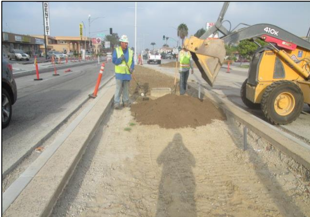
Contractor spreading imported soil in median.