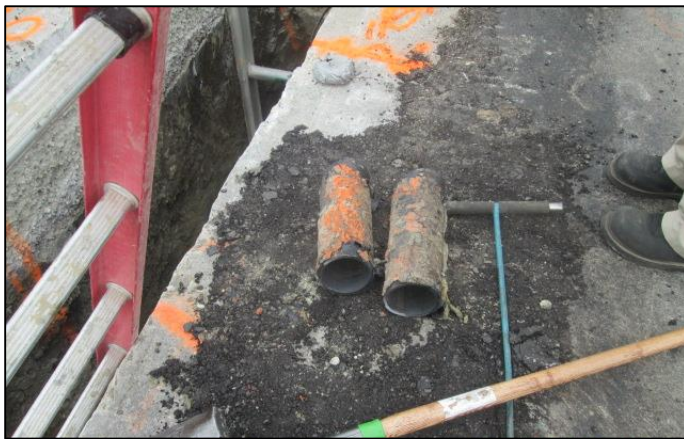
Gas line that was discovered in recycled water trench.