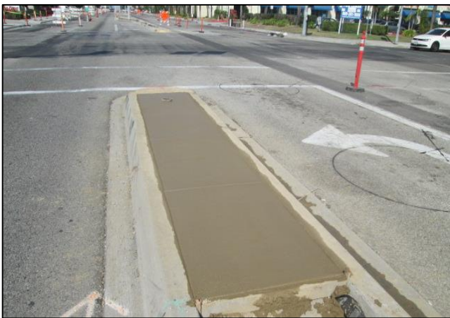
Colored Concrete median on Carson at Grace.