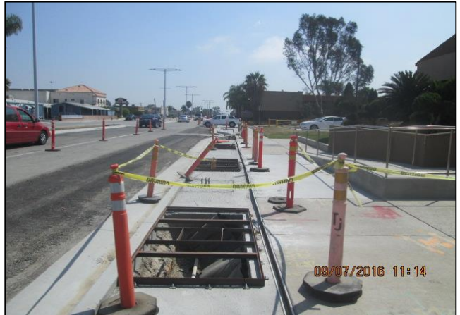
At credit union caution tape needed.