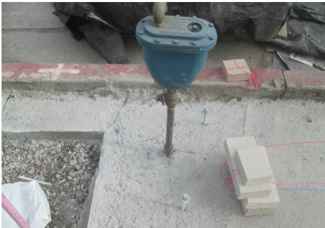
Air vac at transit stop east of Main St.