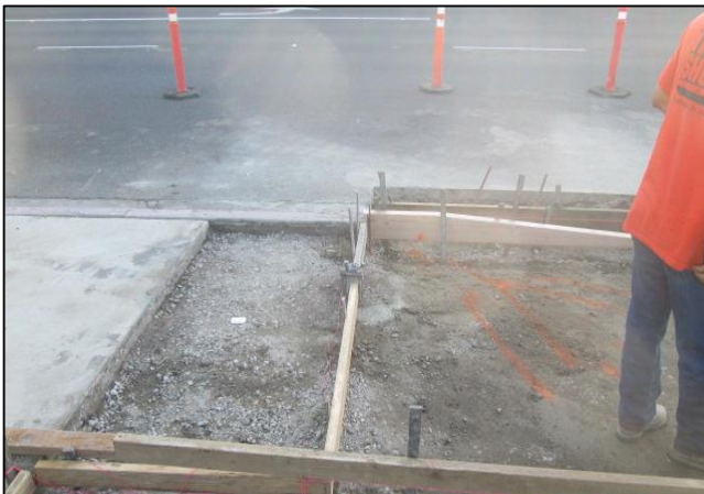
Pedestrian button foundation at Ralph's.