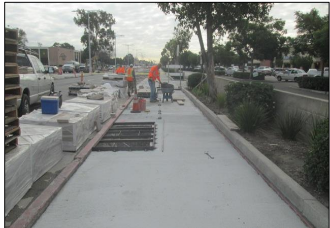
Transit stop east of Main St.