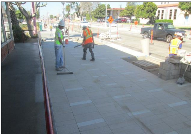
Ready for sealer.