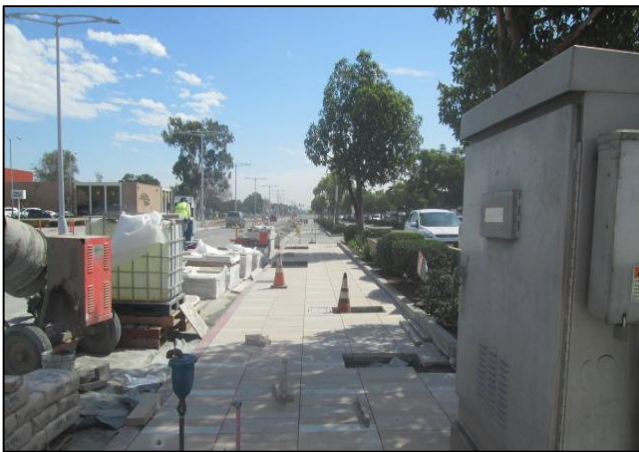
Pavers at Main St. transit stop.