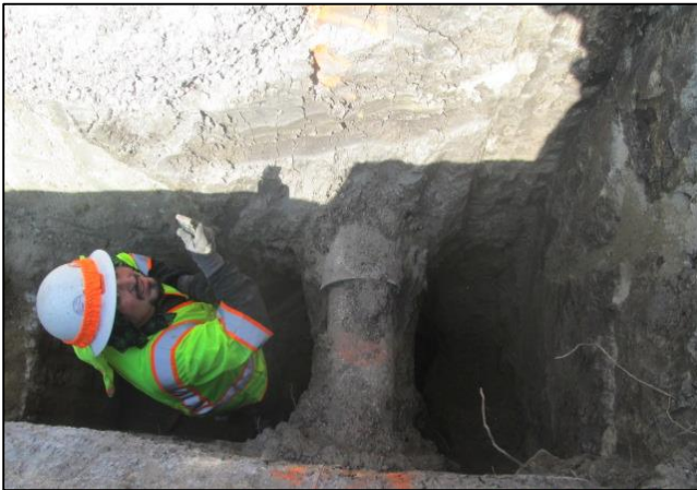
Blow-off trench at Main St.