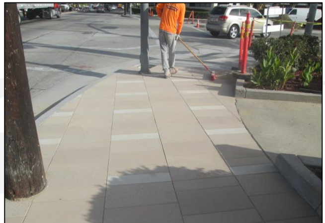
Placing sand infill in pavers at Main and Carson St.