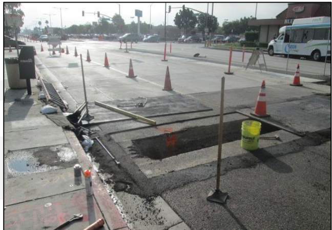
Recycled water line blow-off at Main St.