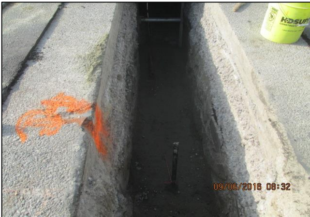
Recycled water line blow-off at Main St.