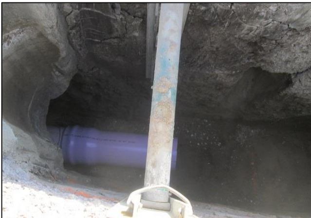
12" recycled water line tie in on Main St.