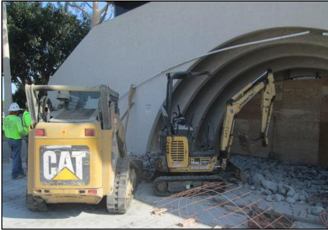
Equipment used for City Hall slab demolition.