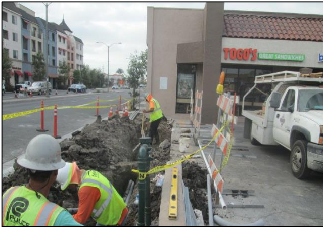
Conduit for new traffic signal at Ralph's driveway.