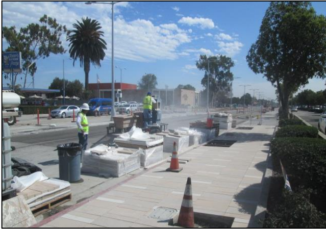
Transit stop at Main St.