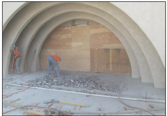
Front of City Hall.