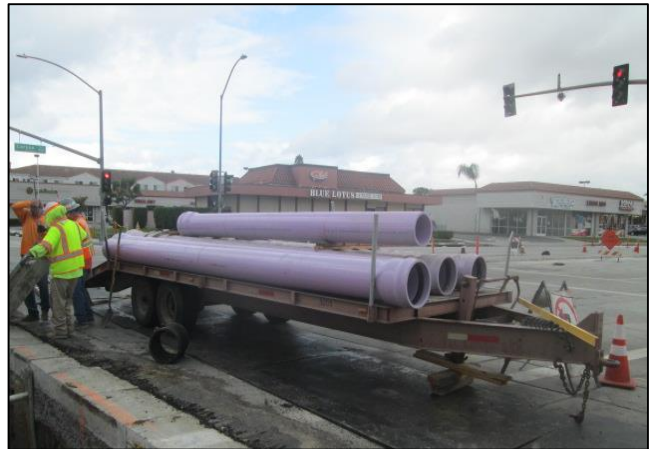
Recycled water pipe ready for placement on Main Street.