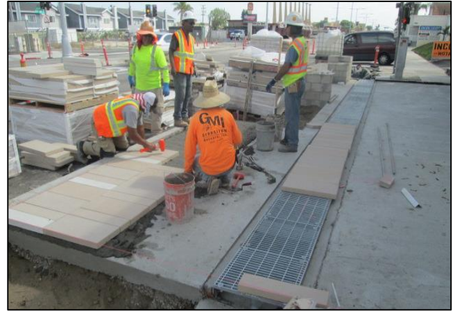
Starting pavers at Winchells.