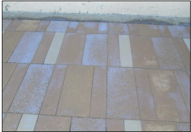
Sealing being applied to pavers typical.