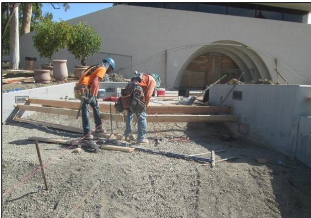
Stairway construction at City Hall