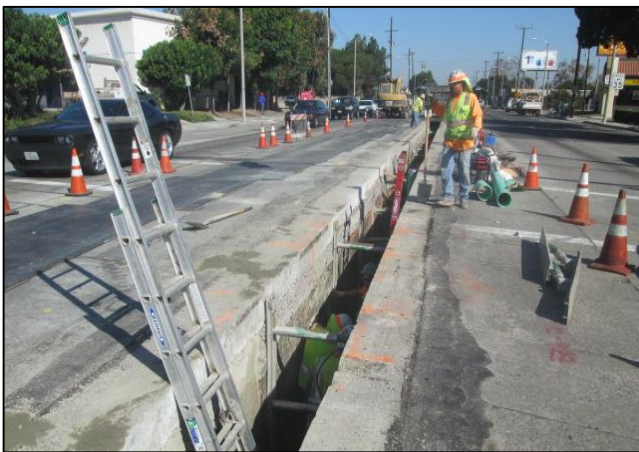
Recycled water liner trench at Main St.