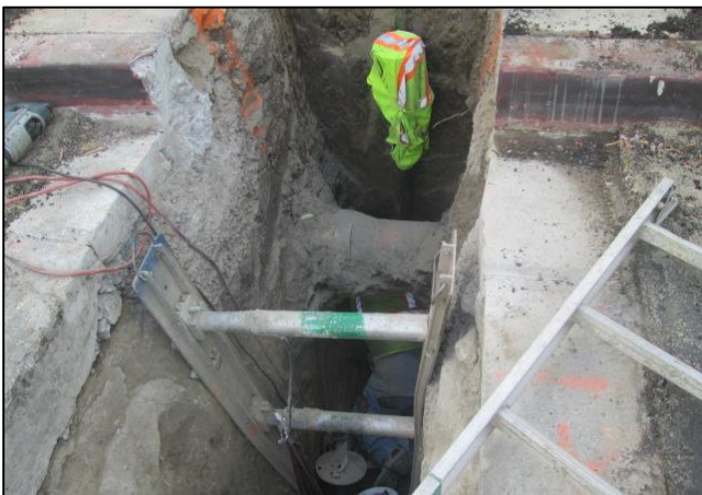
Blow-off trench at Main St.