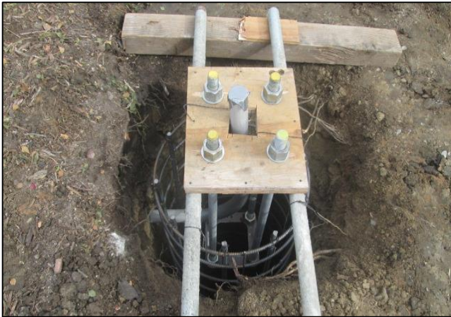
Traffic signal pole cage and anchor bolts on Avalon.