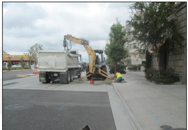
Auguring for new traffic signal foundation on northbound Avalon Blvd.