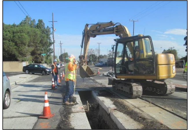
Continuing recycled water trench on Main St.