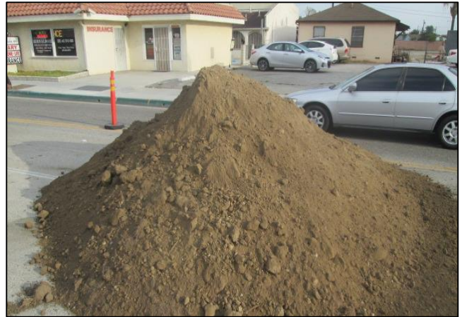
Imported soil being stored.