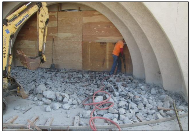
Demolition complete at City Hall front door.