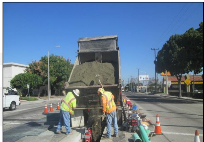
Backfilling recycled water trench.