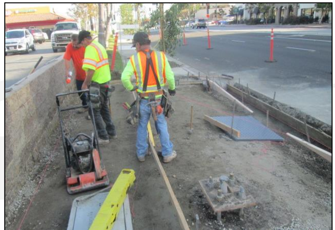
Laying out ADA ramp at Ralph's.