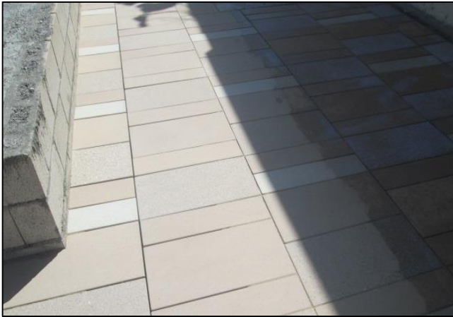
Pavers on the right have been sealed.