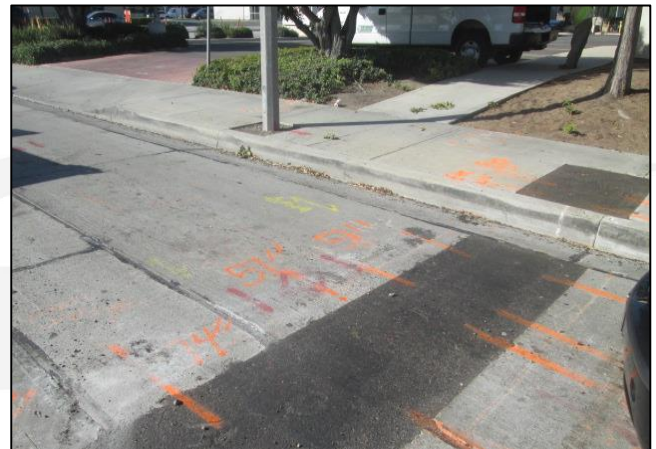
Blow-off location north of Carson on Main many utilities.