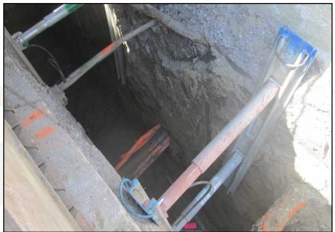
Utilities in blow-off trench at Main St.