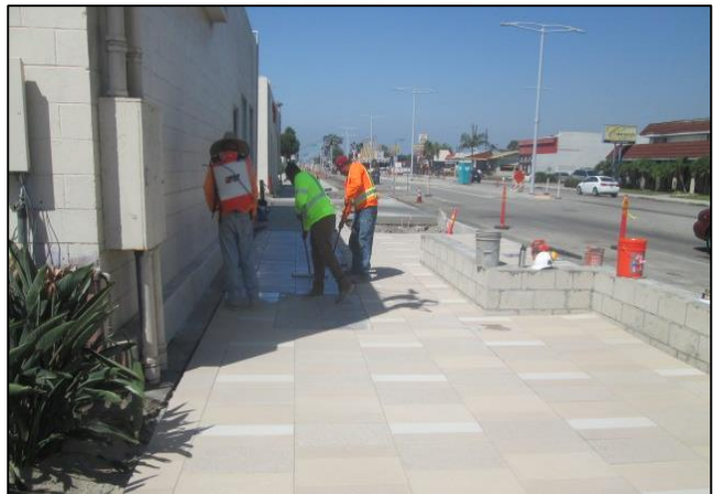
Applying sealer to pavers.