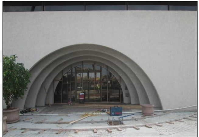
City Hall front door protective framing.