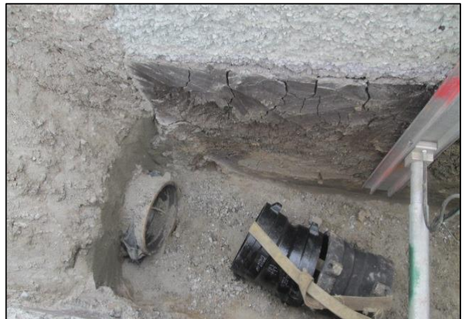
8" recycled water spoils used to align the north bound line.