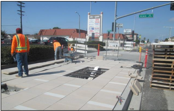
Transit stop at Grace at Carson.