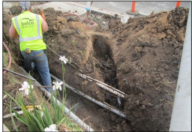
Conduit for new traffic signal at Ralph's driveway.