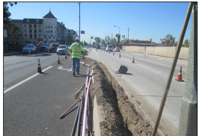
Recycled water line on Avalon Blvd.