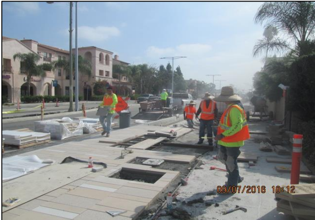
Transit stop east of Grace.