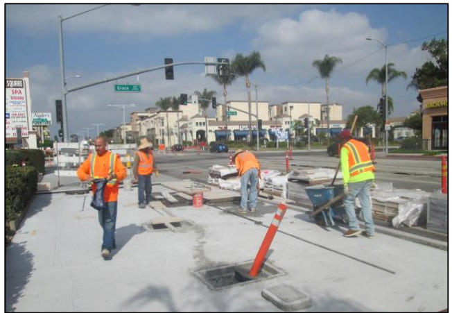
Bus stop at Grace south side.