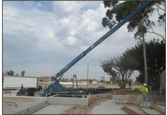
Crane at City Hill needed for lifting plywood.