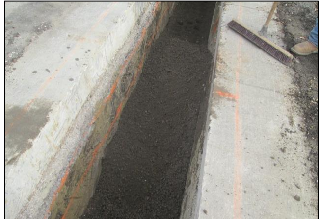
Progress of backfill operation north on Main street.