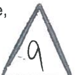
EXHIBIT NO. 02