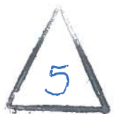
EXHIBIT NO. 03