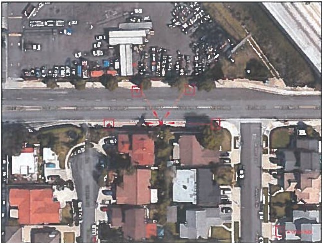
Aerial and Street View:

The applicant proposes to attach antennas and associated equipment to a concrete street light pole with a height of 22.75 feet. The height of the structure after attachment will be 25.6 feet. All equipment will be painted neutral gray in order to blend in with the concrete surface of the light pole in order to minimize its appearance within the surrounding environment. To minimize the aesthetic impacts, the project is conditioned to place the utility meters and conduits for power underground.