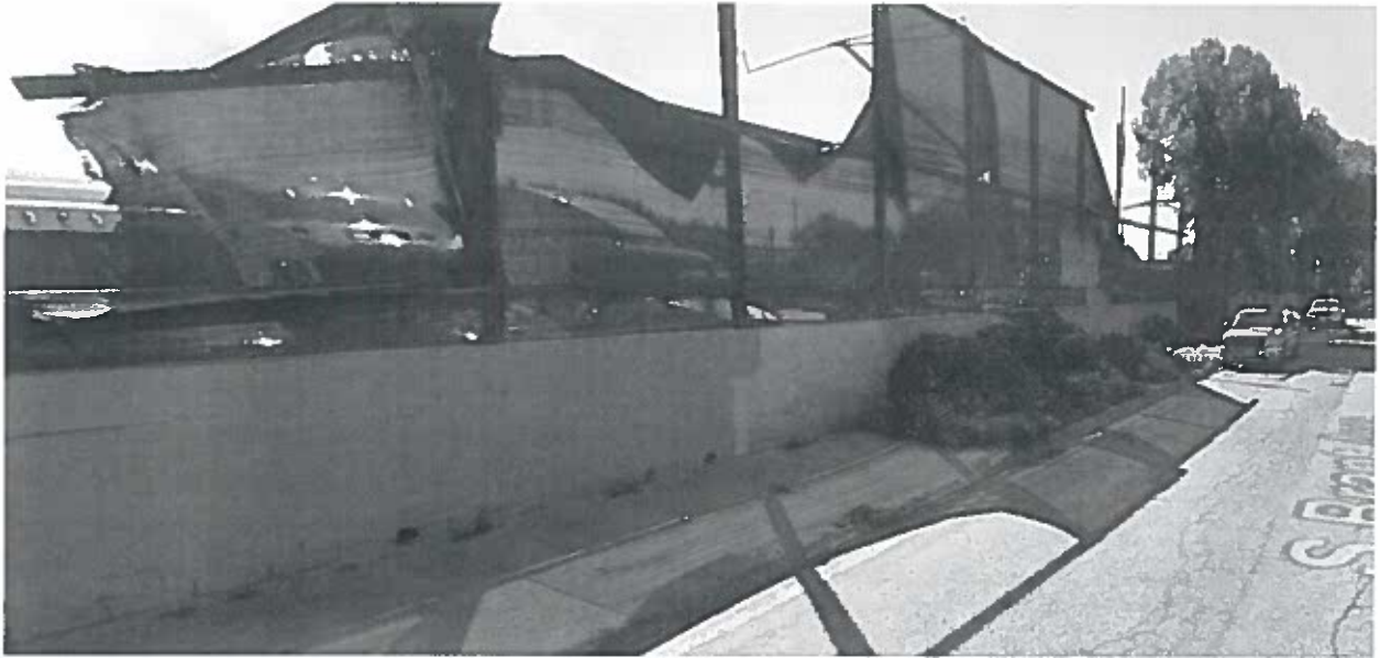
Figure (b) Block wall and fencing material facing Brant Ave