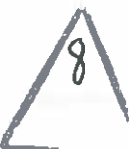
EXHIBIT NO. - 1