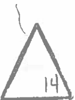
EXHIBIT NO. - 3