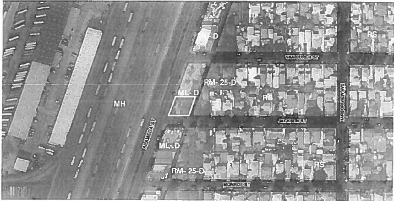
Figure above shows project site in context to its surrounding zoning.

Land uses surrounding the project site consist of single and multi-family residential, light/heavy industrial uses and the Southern Pacific Railroad. Light industrial uses adjoin the northern, southern and eastern boundaries. Residential uses adjoin the eastern boundary.