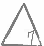
EXHIBIT NO. - 1