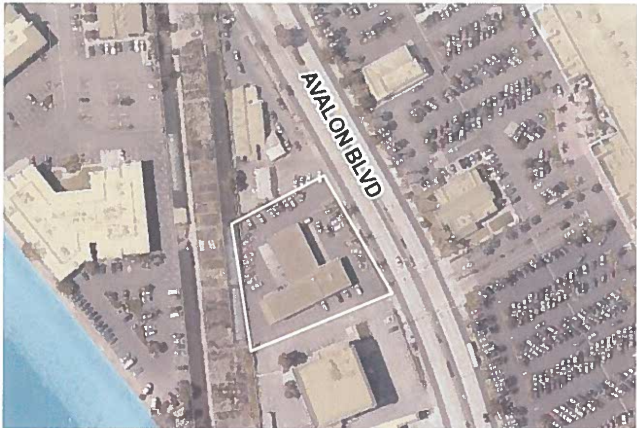
Figure (a) Project Site in context to surrounding zoning.

Land uses surrounding the proposed project site are primarily commercial uses.