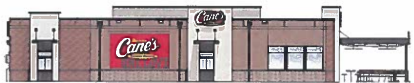
DRIVE THRU ELEVATION SCALE: 1" = 12'-0"