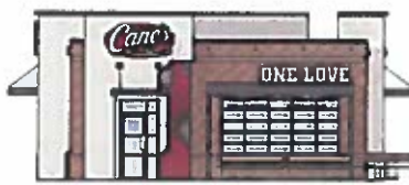
FRONT ENTRY ELEVATION SCALE: 1" = 12'-0"