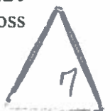
EXHIBIT NO. - 1