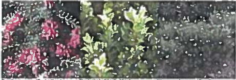
Grevillea angulata 'Cotton Candy'