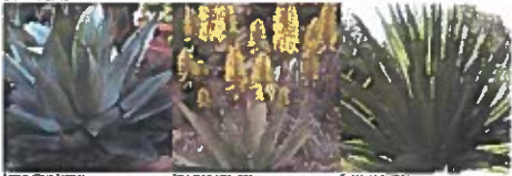
Agave Blue Flame