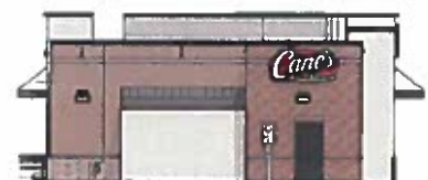
REAR ELEVATION SCALE: 1" = 12'-0"