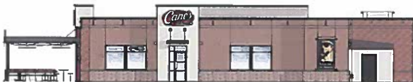
SIDE ENTRY ELEVATION SCALE: 1" = 12'-0"