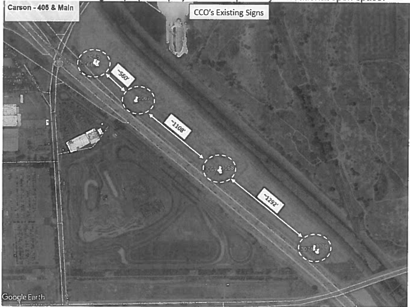
Figure 1: Existing static billboards

Land uses surrounding the proposed project site are primarily recreational/open space.