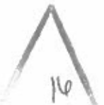
EXHIBIT NO. - 3

Section 5. Pursuant to CEQA, a Draft Mitigated Negative Declaration was prepared and made available for public review from January 17, 2020 through February 17, 2020. A Notice of Intent to Adopt a Draft Negative Declaration was posted with the City Clerk, LA County Clerk, Carson Library, on-site, and sent to responsible agencies. An electronic copy of the document was also posted on the Planning Division