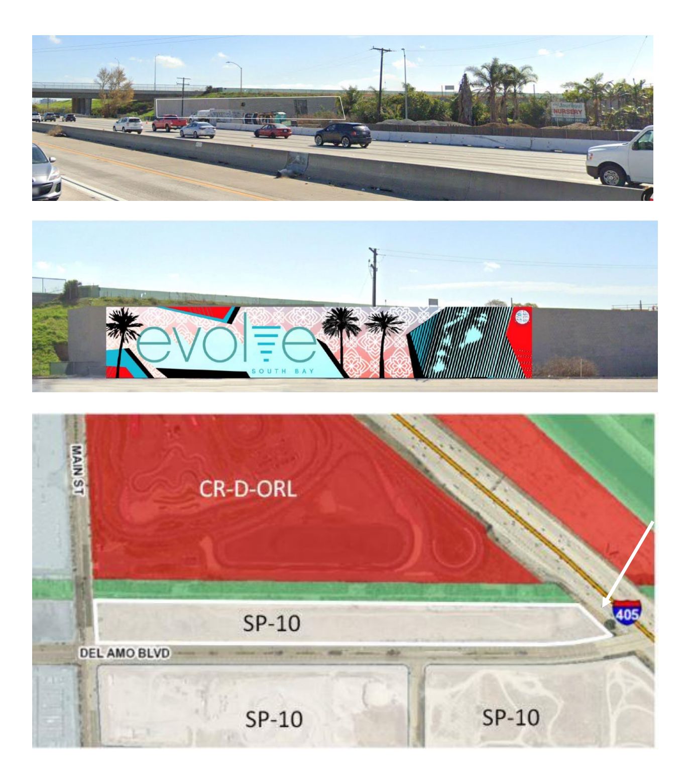
Exhibit 1 Site Elevations