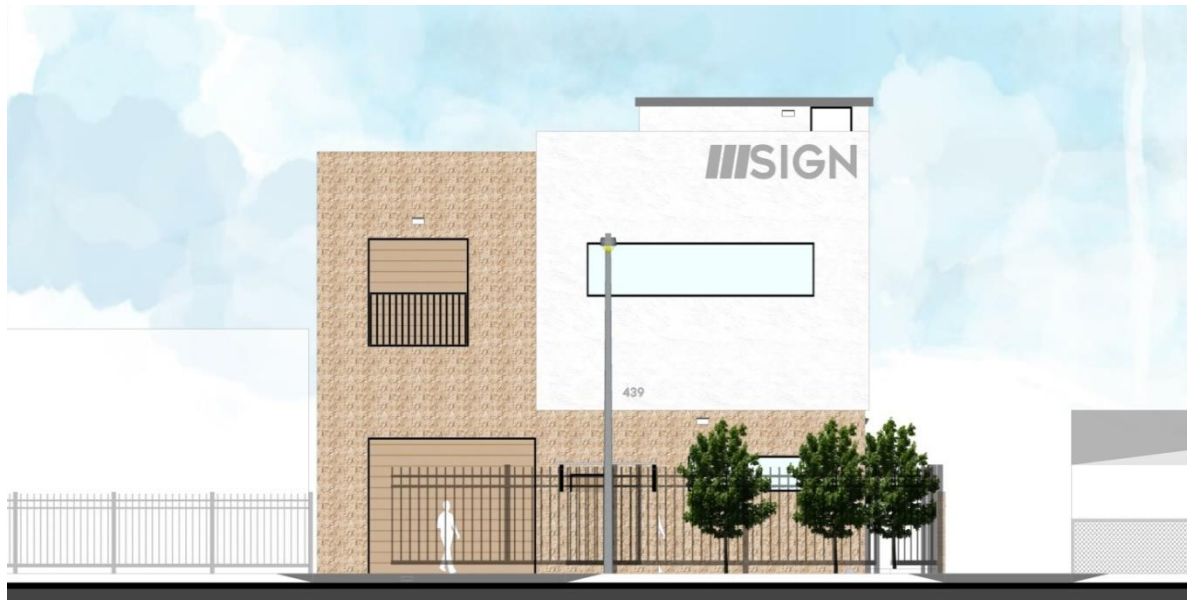
Figure (c) Proposed front elevation

Carson Municipal Code Section 9162.21 requires 1 parking space for every 750 square feet of gross floor area. The proposed developed would require 5 parking spaces; 4 regular and 1 ADA compliant parking spaces are proposed.