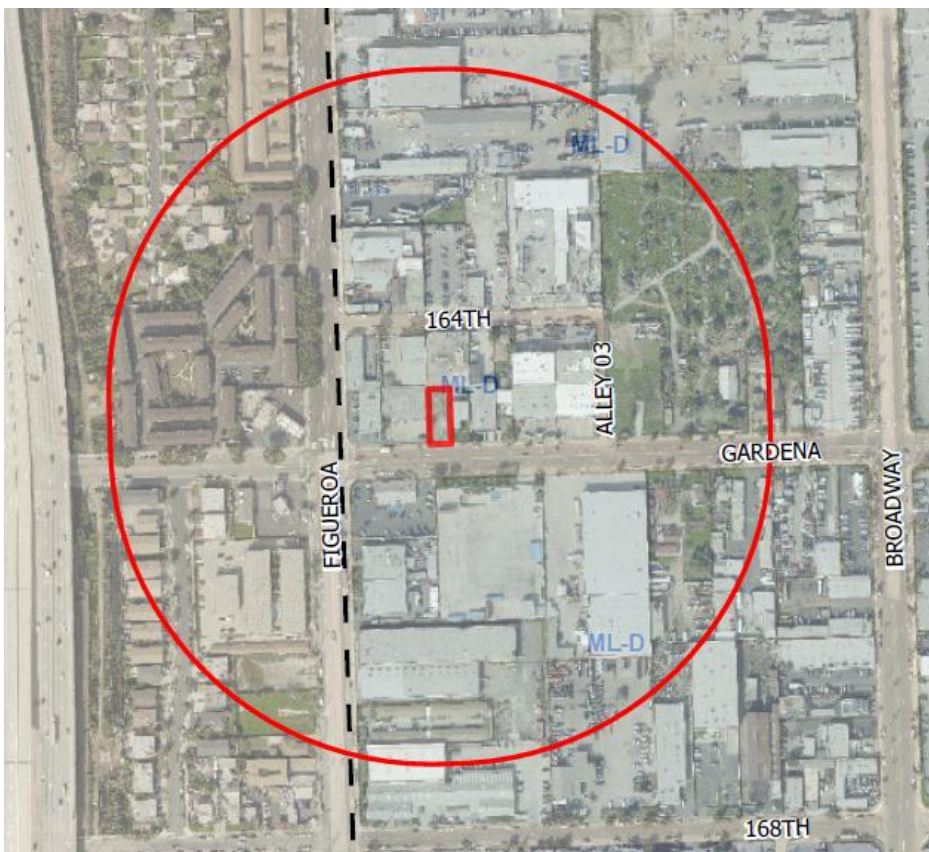
Figure (a) Project Site in context to surrounding zoning

The subject property is located on the northeast corner intersection of Gardena Boulevard and Figueroa Street in a predominantly light industrial area with some commercial uses interspersed.