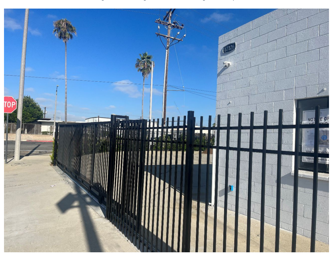
Figure 6 - Address Identification, Parking Lot Driveway Gate Facing Walnut