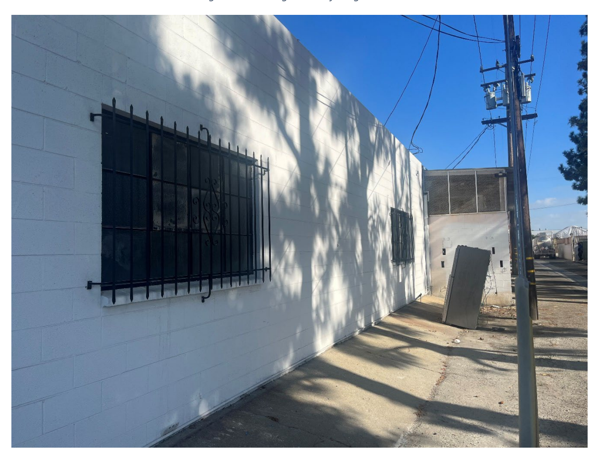
Figure 4 - Building rear exterior facing alley