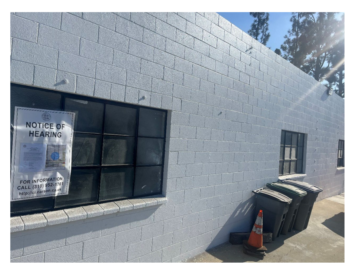
Figure 3 - Building exterior facing Walnut