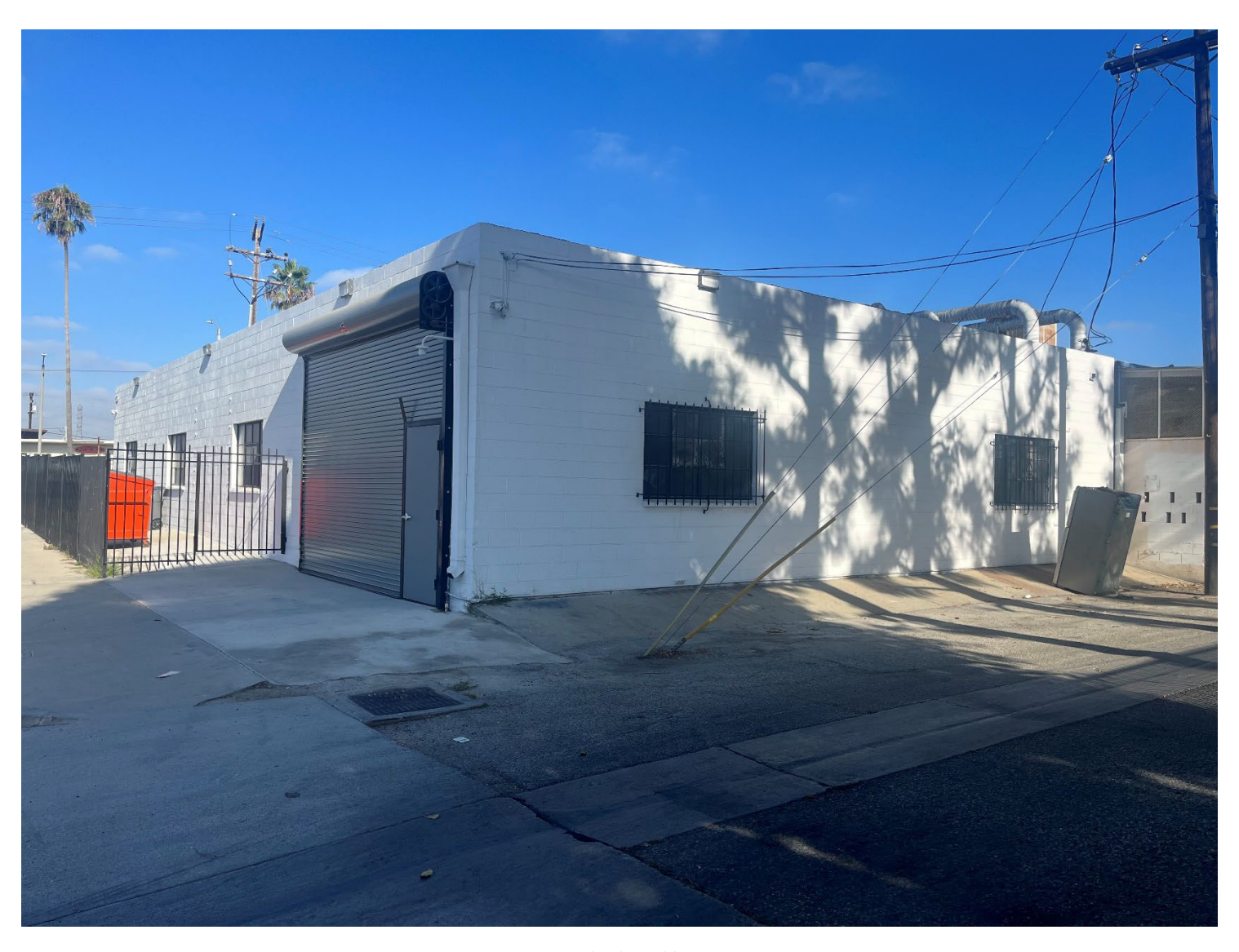
Figure 7 - Rear and Side Building Exteriors