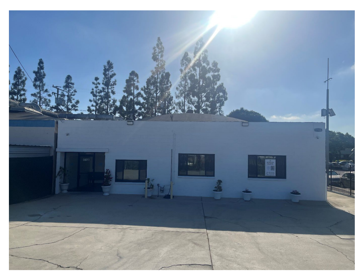
Figure 5 - Building Front Exterior Facing Broadway